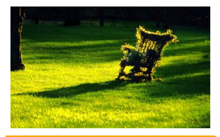
PRELIMINARY REPORT OF 2012 DATA ONLINE

Spring, a time of rebirth is here - or is coming (I promise!) If we can help you with anything, please do not hesitate to contact us.