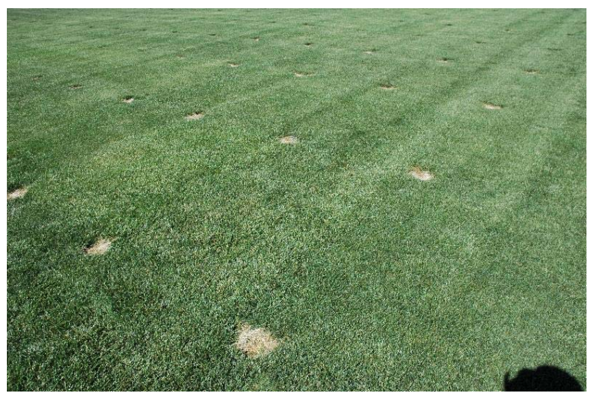
Tall fescue cultivars, shown here in the Penn State trial, have improved color, density and texture.