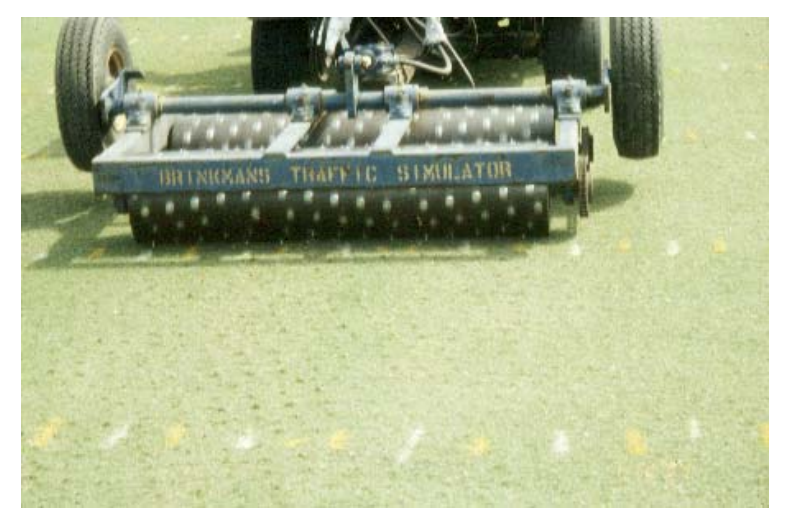
The Brinkman's Traffic Simulator will be utilized to simulate fall football damage at four locations evaluating the 2010 National Perennial Ryegrass Test

Many new perennial ryegrass experimental selections are being established at sites around the U.S. Eighty-eight entries, including seventy-eight experimentals and seven standards (well-known entries for comparison purposes), were sent to twenty-three locations in late August/September 2010. A list <u>entries and sponsors and trial locations</u>, as well as other information, can be found in the <u>NTEP News Room</u>. This trial will be evaluated for the next four years. The first data will be available on the NTEP web site in spring 2012.