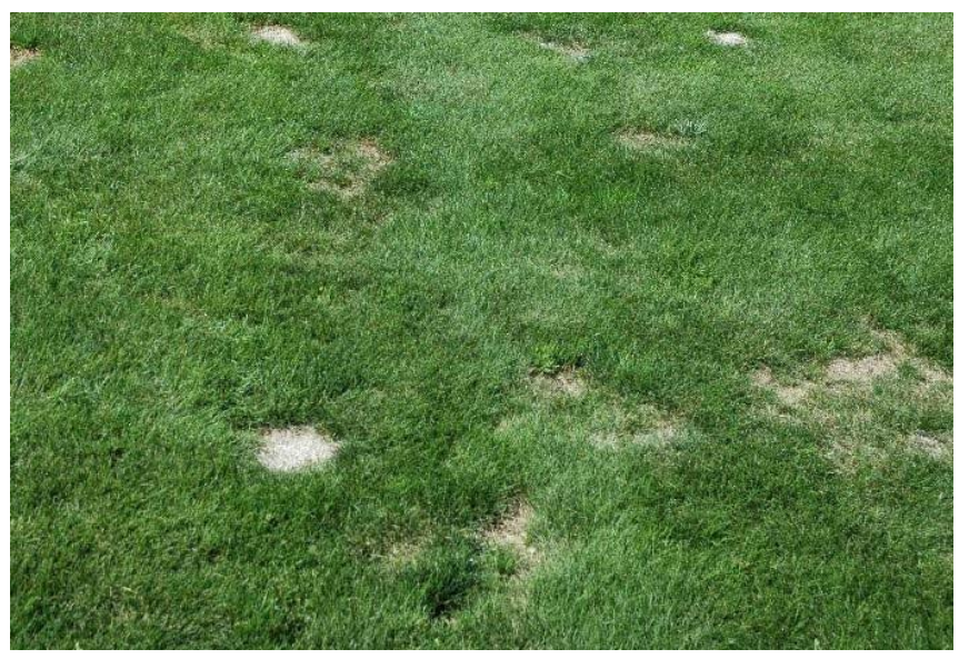
Some fineleaf fescues show damage from patch diseases

In its continuing efforts to produce high quality data, NTEP visits its test locations on a regular basis. Recently, Kevin Morris visited the main campus of Penn State University in State College, PA.