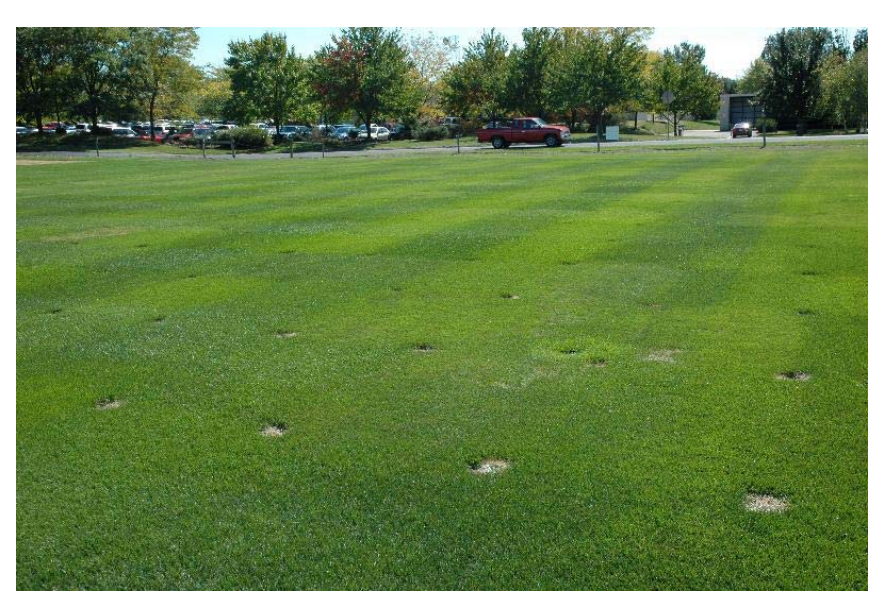
The 2005 NTEP Ky. bluegrass trial is still in excellent condition after five years in State College, PA

Creeping bentgrass is the grass of choice on putting greens in much of the U.S. and Pennsylvania is no exception. Bentgrasses are also used on golf course fairways and tees in some locations. Penn State trials are testing cultivars in both of these situations. On the day of the site visit, the entries Alpha, MVS-AP101, SRP-1GMC, V-8 and PST-OJO were the best looking cultivars in the putting green trial. The velvet bentgrass cultivars, as a group, have not performed well to date. The trial is maintained at a 0.125" mowing height with 2 lbs. of nitrogen/1000 sq. ft. applied annually. Overall, the trials at Penn State are in excellent condition and are providing valuable data for Pennsylvania and the mid-Atlantic region.